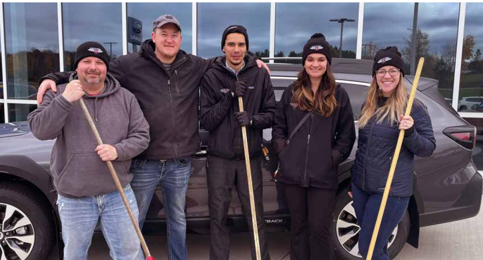
Volume Two • 2023